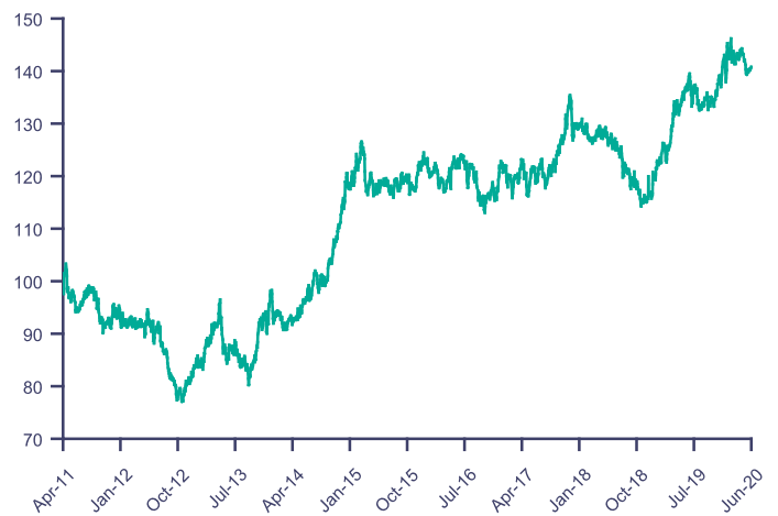
Past performance does not guarantee of future results. Performance is presented net of fees and expenses.